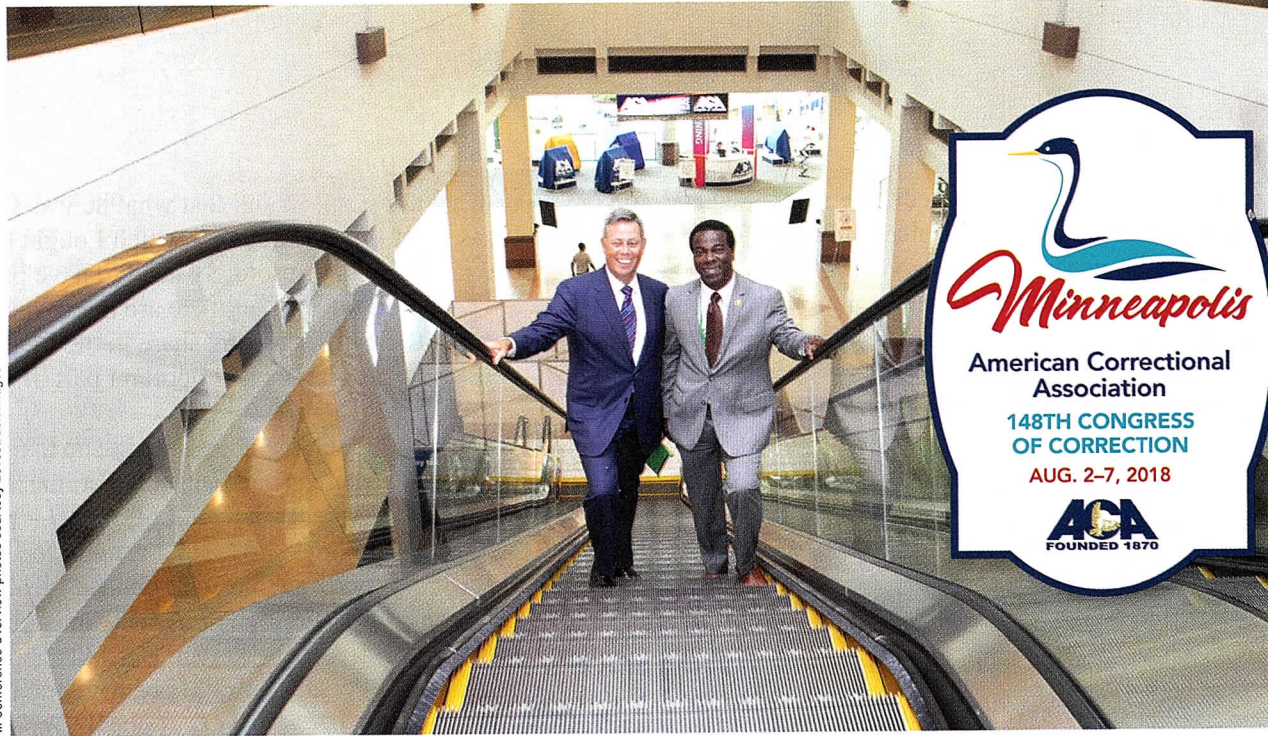
All Conference Overview photos courtesy Lovestruck Images