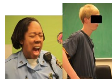
"Guess What's In The Box" *PRICELESS*