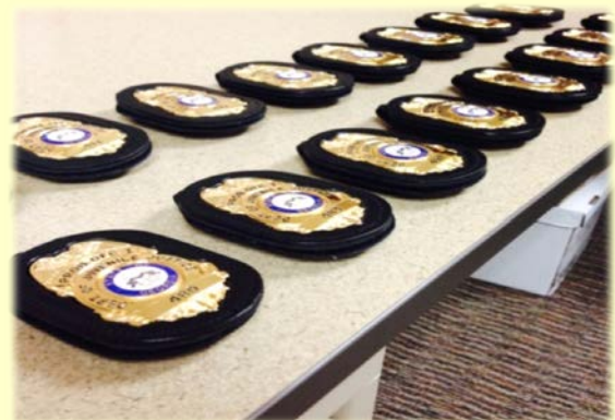
BJPOT Class #003 Swearing In Ceremony November 4 th , 2015