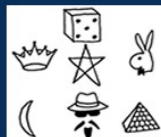
National Symbols of the People Gang